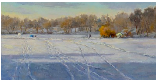
Michele Combs - Winter Trails