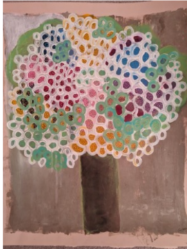
Nan Foker - Leaves of Healing Light