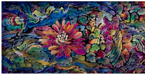
Shakuntala Maheshwari - Symbolic Flower Lotus