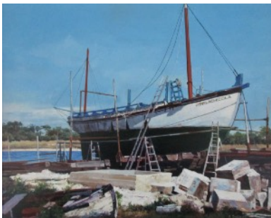
Fred Dinger - Apachicola Up for Repairs