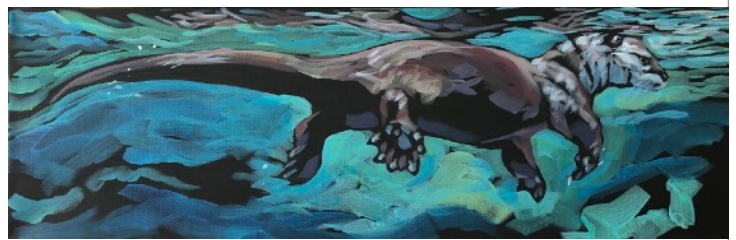
Kat Corrigan - Breaking the Surface