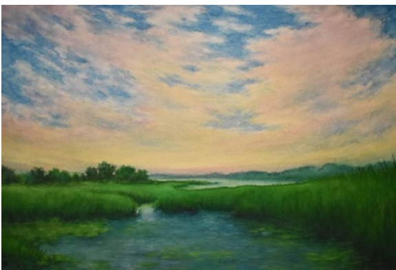
Donald Aggerbeck - Clearwater Creek Meets Bald Eagle Lake