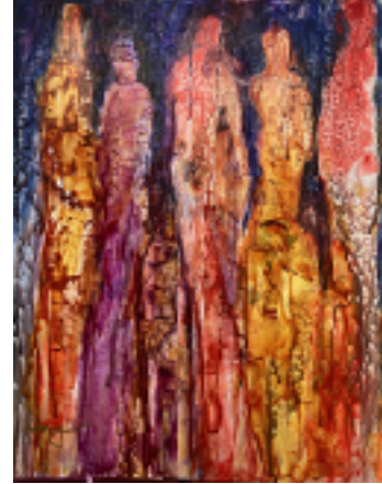
"The Five of Us" by Leny Wendel