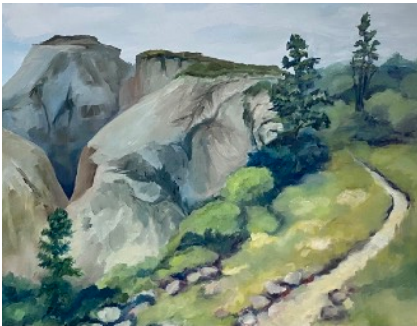
Rita Beyer Corrigan Zion National Park Oil