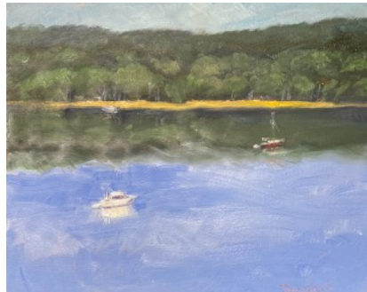
Tom Dimock Little Gem Oil