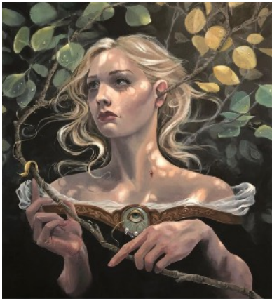
Surelle Schewe Minerva Acrylic on canvas