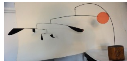
Jack O'Leary Homage to A. Calder Mobile, wire & wood