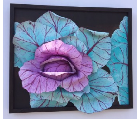
Teresa Diffley The Purple Cabbage Acrylic & yarn, 3D painting