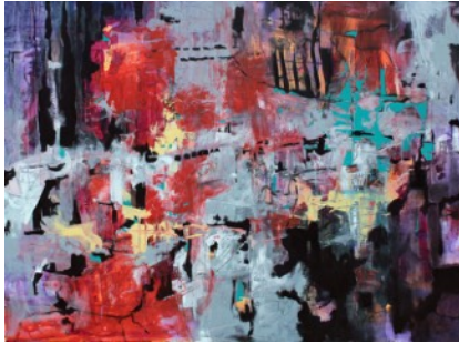
Calvin deRuyter Oz Mixed watermedia