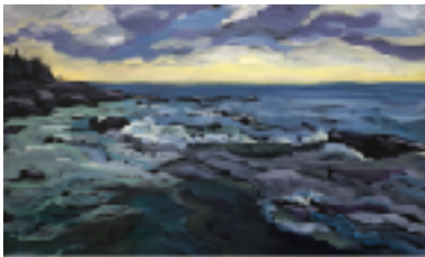
Water Lights and the Yellow Line - acrylic