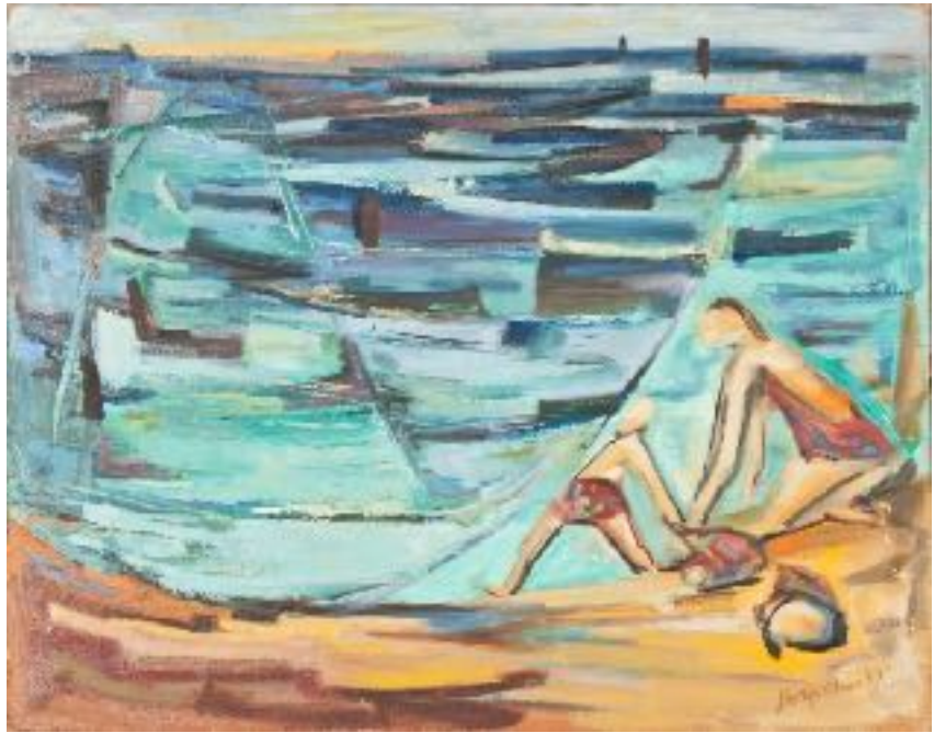
At the Beach