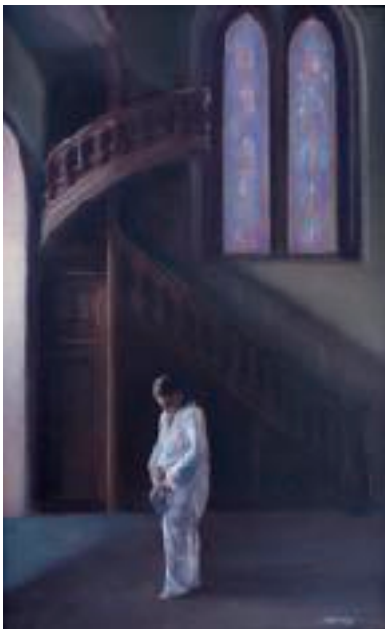
The Quiet Prayer, oil