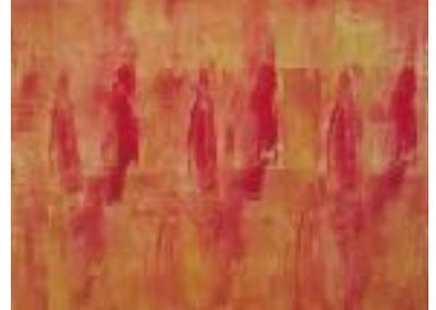
Passages - oil and cold wax