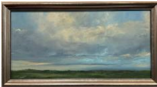
Love Will Meet You There