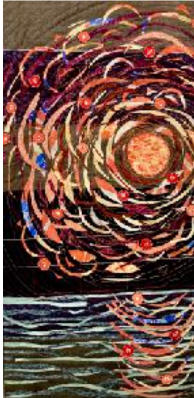
Life Force - quilt