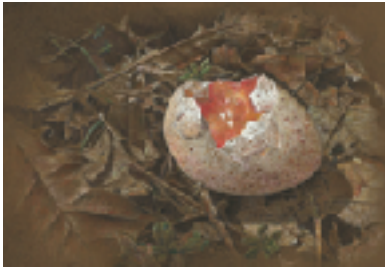
All the King's Horses - colored pencil