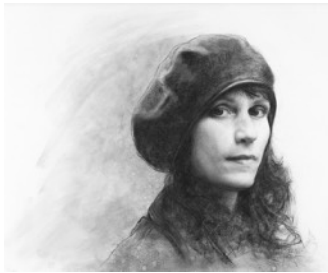
portrait In My Life

Two of her art pieces are semi-finalists in the Art Renewal Center's 16th International Portrait Salon.