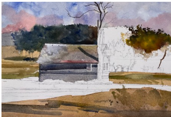
Fred's demo, in progress

He doesn't specialize in one medium and happily uses multiple mediums in one painting always using fresh Fred Dingler (continued on page 6)