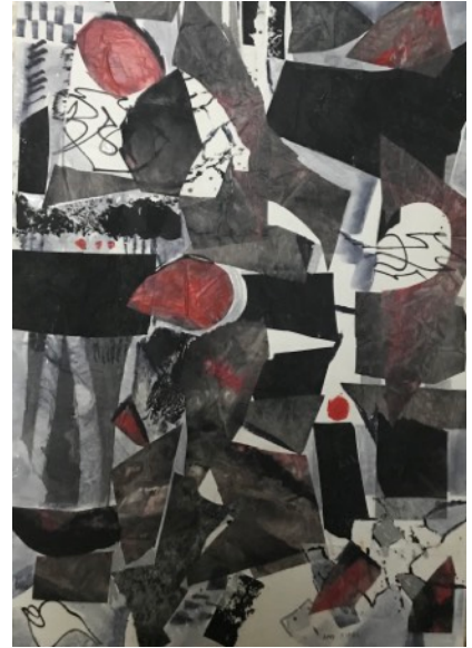
Ann Sisel - Point Rouge - Acrylic & Collage

Fabulous point of view. I'm an eagle in this painting. It's an anthem to our great waterways. It is also a warning, I think. As we move down the composition, the state of the river becomes unclear, like where the Ohio River mixes its mud with the Mississippi. The forced perspective speaks to the force of nature, and I think to the river's unknown outcome. Nicely done.