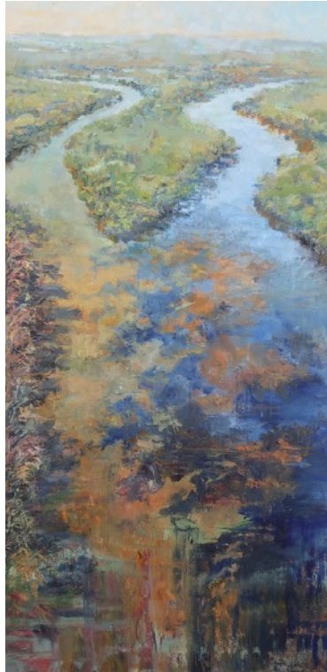
Greg Lecker - Confluence - Oil on canvas

Simply, it's a gorgeous gesture of a landscape. It is succinct and engaging. The color is true and concise. This painting has all the proper features, and still it is surprising. Yes, I believe it is the gesture, the directness, the confidence, packed into a gem sized image. All that warm color and it feels so cold.