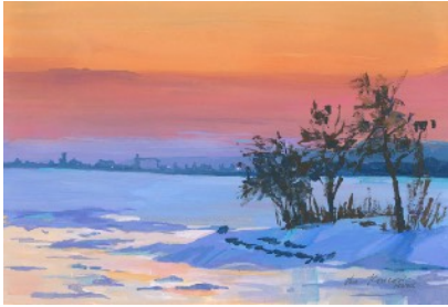
Vera Kovacovic - Winter Colors Magic - Gouache

Simply, it's a gorgeous gesture of a landscape. It is succinct and engaging. The color is true and concise. This painting has all the proper features, and still it is surprising. Yes, I believe it is the gesture, the directness, the confidence, packed into a gem sized image. All that warm color and it feels so cold.