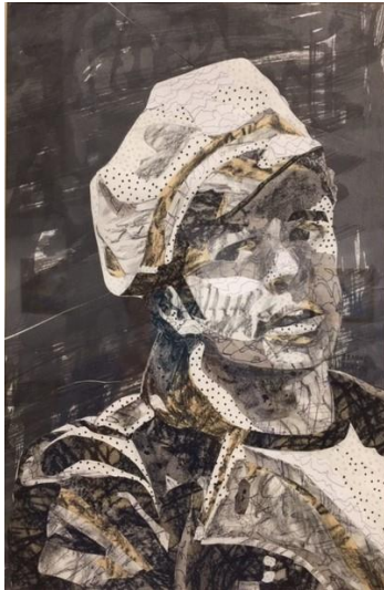
Brando in Pieces – Jeanne Kenton

then figured out the value (dark and light) of each paper. I drew the subject on a separate piece of paper, figured out shapes of different values, and matched them up with the papers I had made, cut out each piece and glued it onto the final paper. It was a time consuming project, but very fun.