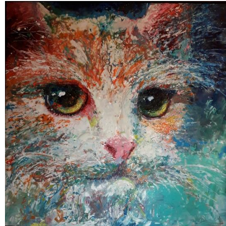
#6 (the cat) – Jim Geisinger

and three votes. 121 votes were cast in all, which may have been the largest people's choice vote in MAA history. Following these awards, we had a fine show and tell with a display of a wide variety of media and subjects.