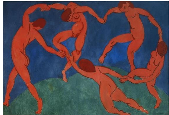
La Danse – Henri Matisse 1909-10

participation will enhance the value and content. News, articles, announcements, letters, tips, resources, and other items for the newsletter should be submitted to the Editor by the 20 th of each month at khkomadina@gmail.com . Content may be edited.