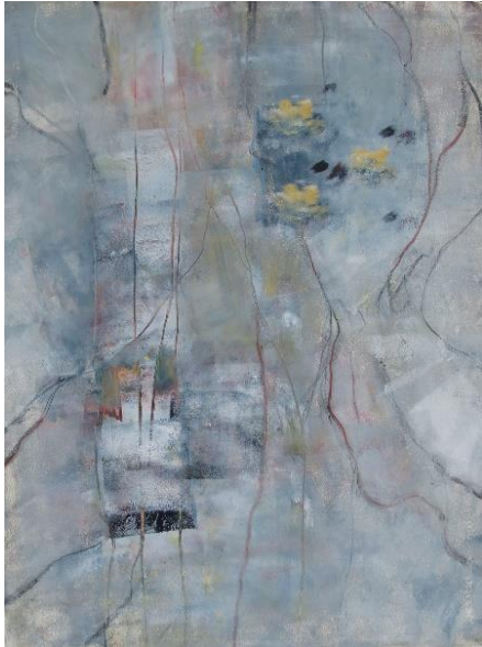
Winter Meditation #2