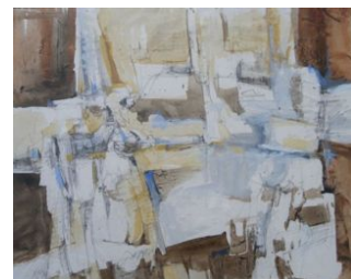
Jack O'Leary "City Center" - Watercolor