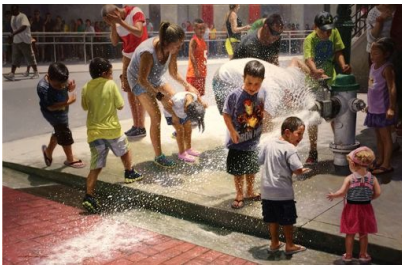
Gary Carabio "Beating the Heat" - Oil