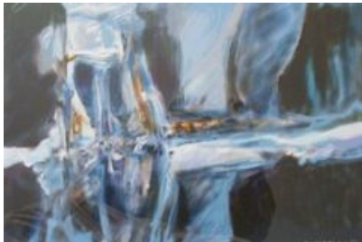
Jack O'Leary - "Motherlode" Digital