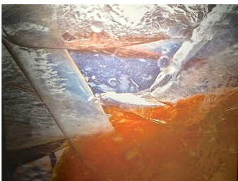
Edie Karras "Summer" - Digital