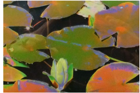
Rebecca Wood "Lily Pads" - Digital Photo