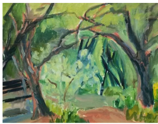
Marjorie Moody "Peace Garden #2" Oil on paper