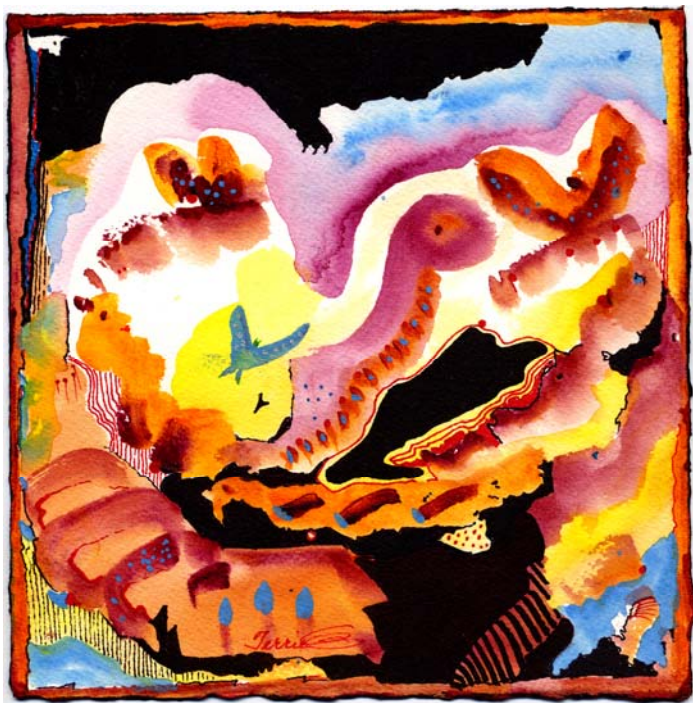
More Art by Terrie Above: Metamorphosis Below: Cat on a Hot Red Horse